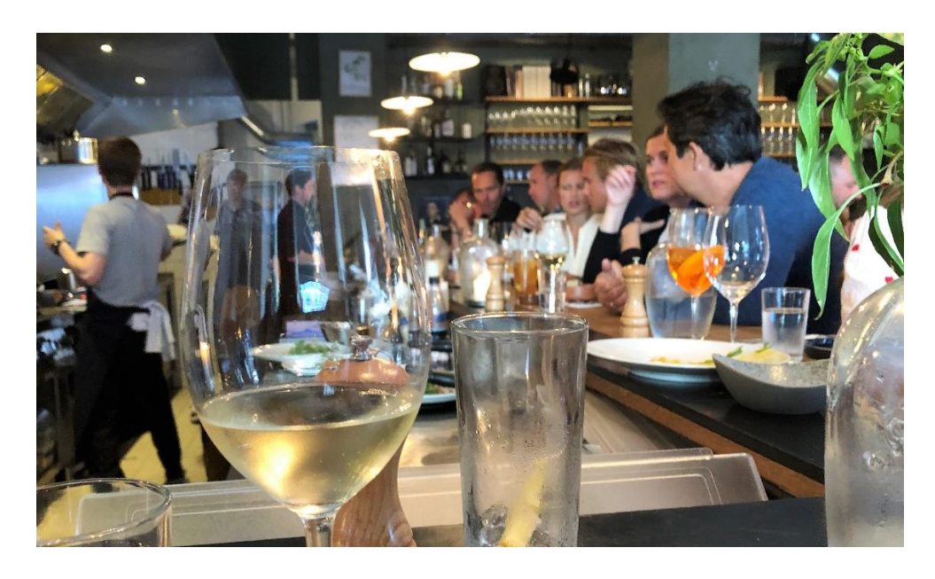
Restaurant Totto, Amagerbrogade